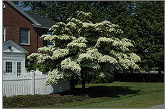
Chinese Dogwood in bloom

This is a relatively low maintenance tree, and should only be pruned after flowering to avoid removing any of the current season's flowers. It is a good choice for attracting birds to your yard. It has no significant negative characteristics.