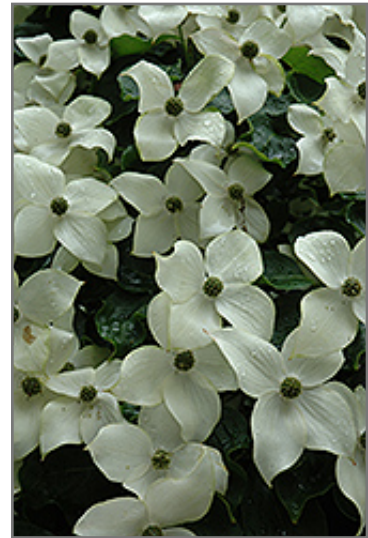
Chinese Dogwood flowers