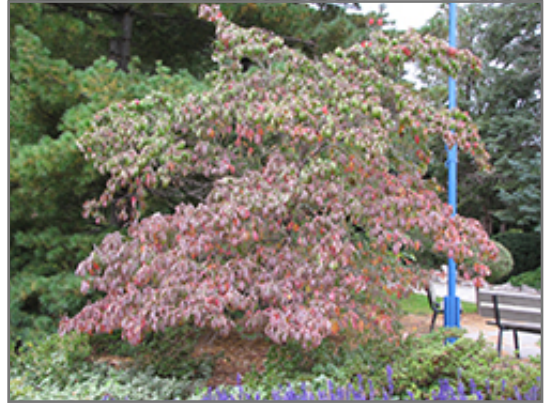
Chinese Dogwood in fall

This tree does best in full sun to partial shade. It does best in average to evenly moist conditions, but will not tolerate standing water. It is very fussy about its soil conditions and must have rich, acidic soils to ensure success, and is subject to chlorosis (yellowing) of the foliage in alkaline soils. It is somewhat tolerant of urban pollution, and will benefit from being planted in a relatively sheltered location. Consider applying a thick mulch around the root zone in winter to protect it in exposed locations or colder microclimates. This species is not originally from North America.