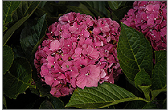
Red Sensation Hydrangea flowers