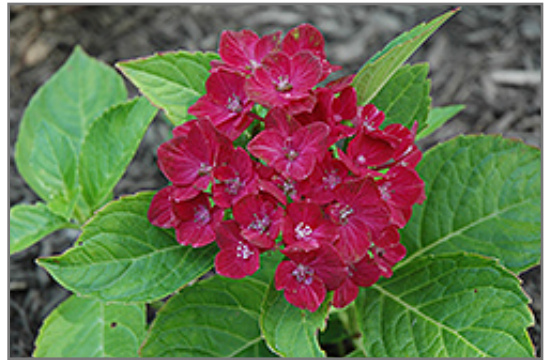
Red Sensation Hydrangea flowers