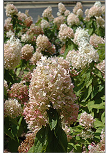
Sweet Summer Hydrangea flowers (faded)

* This is a 'special order' plant - contact store for details