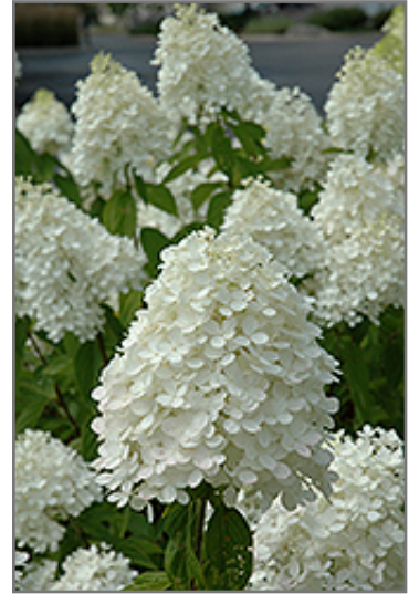
Sweet Summer Hydrangea flowers