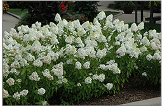
Sweet Summer Hydrangea in bloom