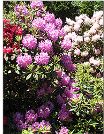
Boursault Rhododendron in bloom