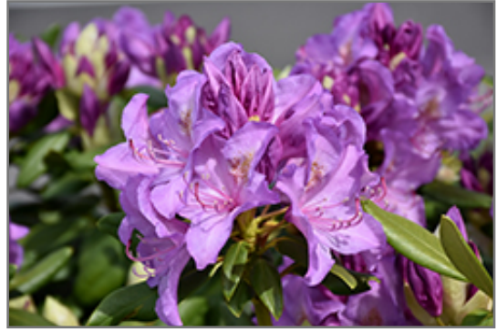
Boursault Rhododendron flowers