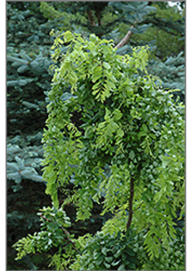
Twisted Baby Black Locust foliage

* This is a 'special order' plant - contact store for details