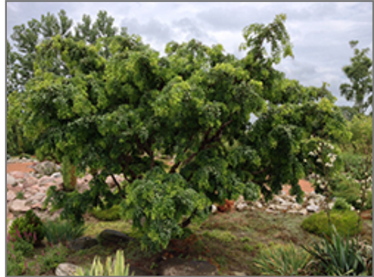
Twisted Baby Black Locust

This is a high maintenance shrub that will require regular care and upkeep, and is best pruned in late winter once the threat of extreme cold has passed. Deer don't particularly care for this plant and will usually leave it alone in favor of tastier treats. Gardeners should be aware of the following characteristic(s) that may warrant special consideration;