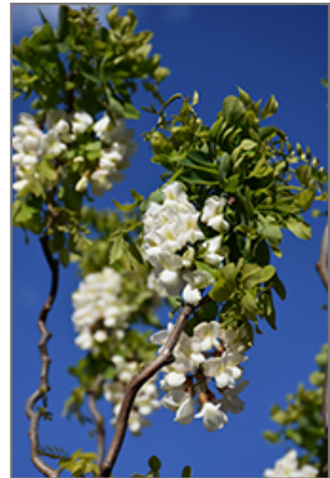
Twisted Baby Black Locust flowers