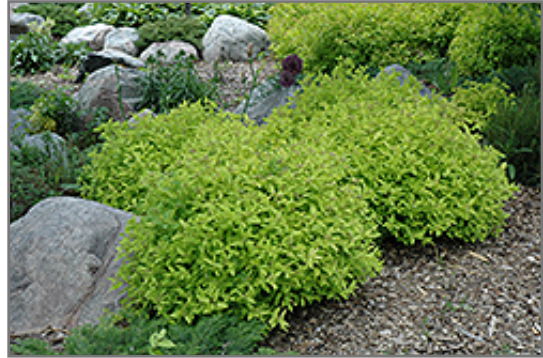
Goldmound Spirea