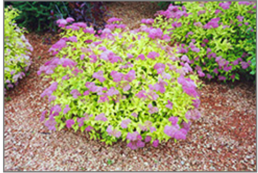
Goldmound Spirea in bloom

This shrub should only be grown in full sunlight. It prefers to grow in average to moist conditions, and shouldn't be allowed to dry out. It is not particular as to soil type or pH. It is highly tolerant of urban pollution and will even thrive in inner city environments. This is a selected variety of a species not originally from North America.