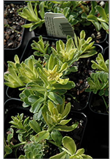
Sweet And Sour Russian Stonecrop

Sweet And Sour Russian Stonecrop is recommended for the following landscape applications;