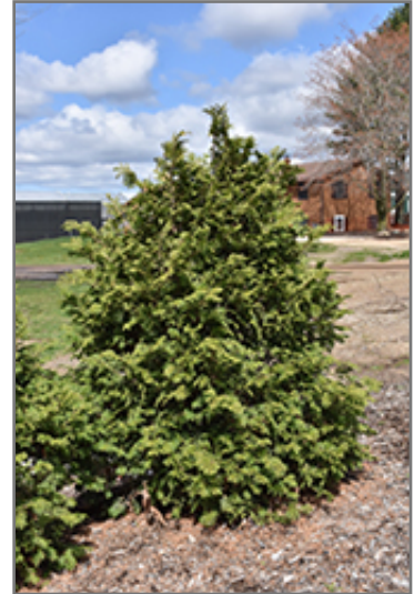
Soft Serve Falsecypress

* This is a 'special order' plant - contact store for details