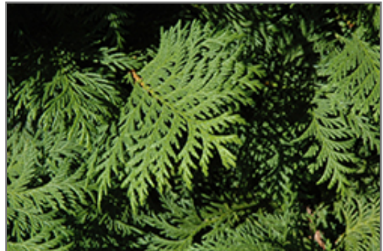
Soft Serve Falsecypress foliage