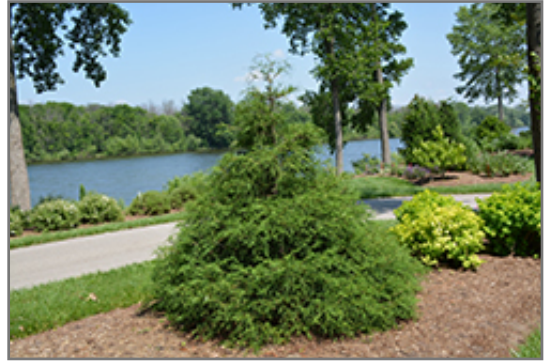
Soft Serve Falsecypress

Soft Serve Falsecypress is recommended for the following landscape applications;