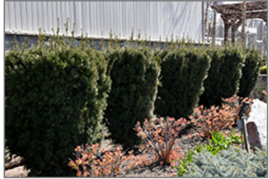
Hicks Yew

This shrub performs well in both full sun and full shade. However, you may want to keep it away from hot, dry locations that receive direct afternoon sun or which get reflected sunlight, such as against the south side of a white wall. It does best in average to evenly moist conditions, but will not tolerate standing water. It is not particular as to soil type or pH. It is highly tolerant of urban pollution and will even thrive in inner city environments, and will benefit from being planted in a relatively sheltered location. Consider applying a thick mulch around the root zone in winter to protect it in exposed locations or colder microclimates. This particular variety is an interspecific hybrid, and parts of it are known to be toxic to humans and animals, so care should be exercised in planting it around children and pets.