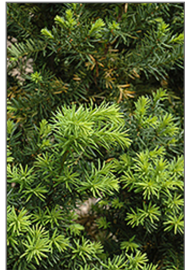
Hicks Yew foliage