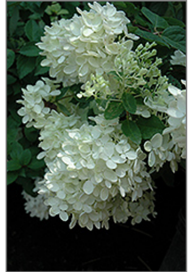
Bombshell Hydrangea flowers

* This is a 'special order' plant - contact store for details