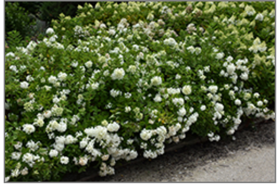
Bombshell Hydrangea in bloom