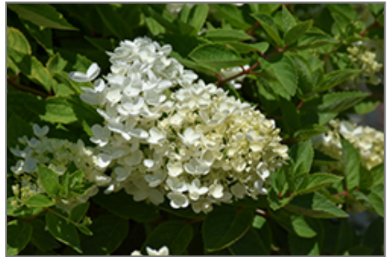
Bombshell Hydrangea flowers