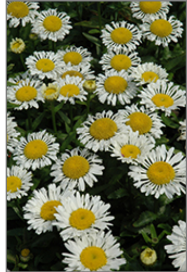
Lacrosse Shasta Daisy flowers