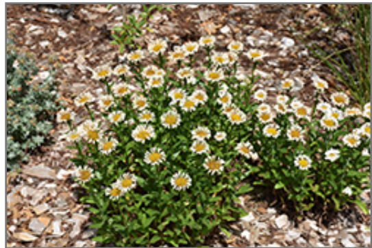
Lacrosse Shasta Daisy in bloom