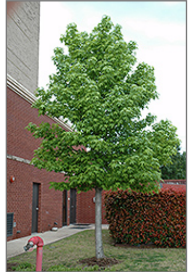
Happidaze Sweet Gum

* This is a 'special order' plant - contact store for details