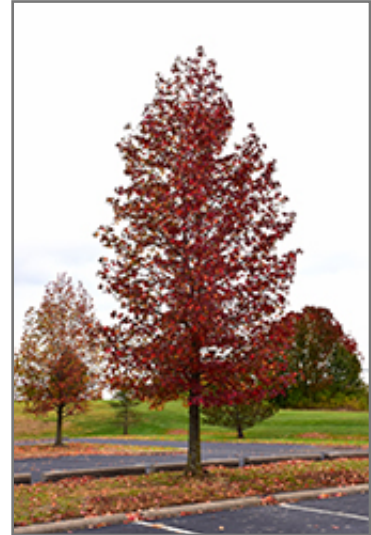
Happidaze Sweet Gum in fall