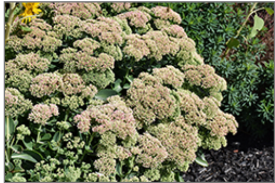
Autumn Joy Stonecrop in bloom