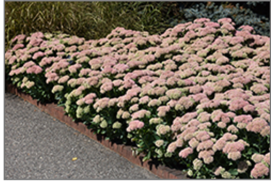
Autumn Joy Stonecrop in bloom

Autumn Joy Stonecrop is recommended for the following landscape applications;