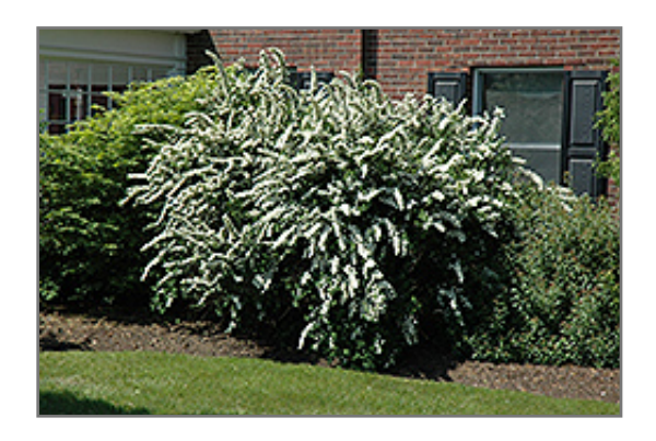
Renaissance Spirea in bloom