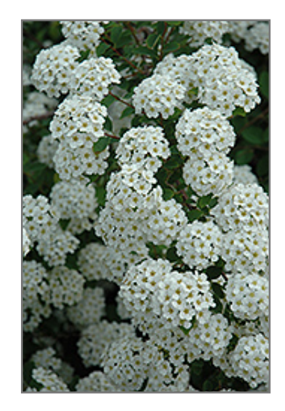
Renaissance Spirea flowers