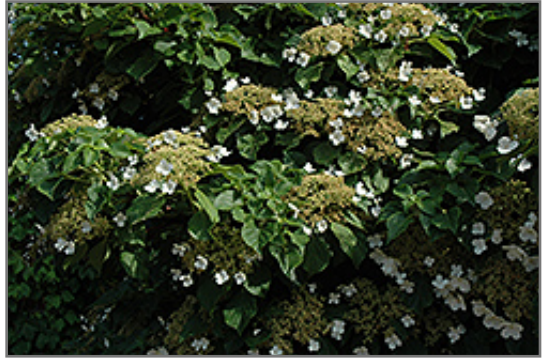
Skyland Giant Climbing Hydrangea flowers