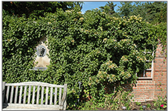
Skyland Giant Climbing Hydrangea in bloom