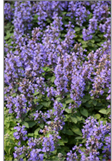
Purrsian Blue Catmint flowers

Purrsian Blue Catmint is recommended for the following landscape applications;