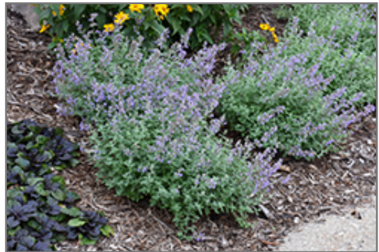
Purrsian Blue Catmint in bloom