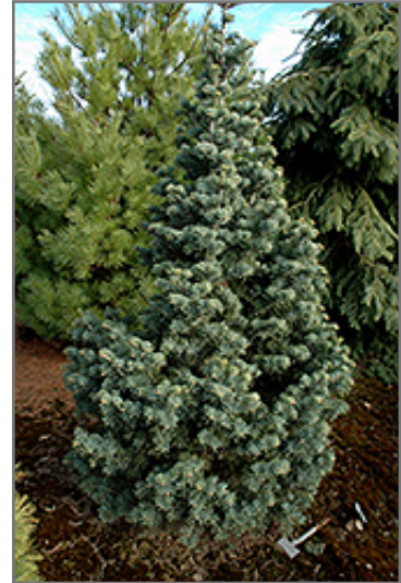
Compact White Fir

The Compact White Fir will grow to be about 8 feet tall at maturity, with a spread of 6 feet. It tends to fill out right to the ground and therefore doesn't necessarily require facer plants in front, and is suitable for planting under power lines. It grows at a slow rate, and under ideal conditions can be expected to live for 80 years or more.