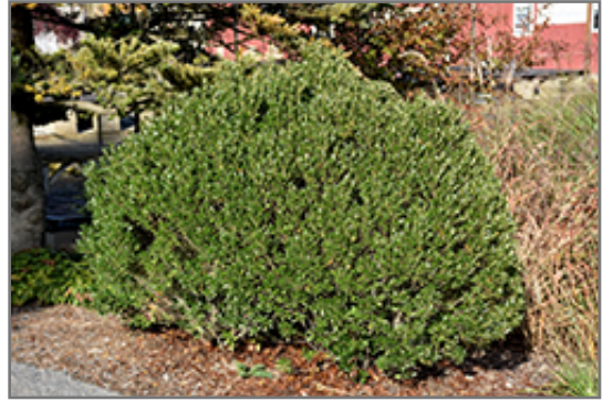
Shamrock Inkberry Holly