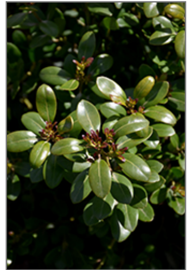
Shamrock Inkberry Holly foliage