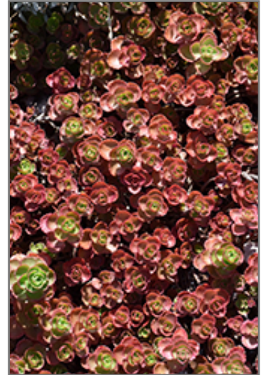
Dragon's Blood Stonecrop in fall

This plant will require occasional maintenance and upkeep, and is best cleaned up in early spring before it resumes active growth for the season. Deer don't particularly care for this plant and will usually leave it alone in favor of tastier treats. Gardeners should be aware of the following characteristic(s) that may warrant special consideration;