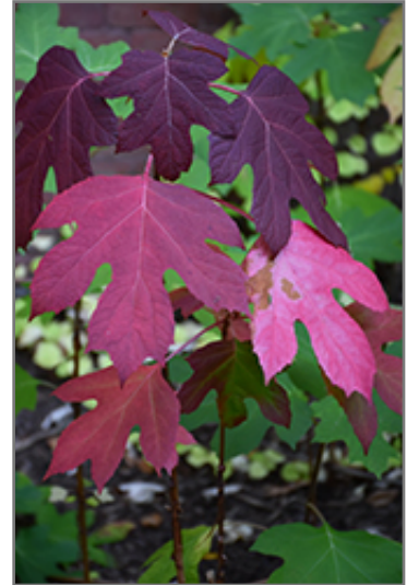
Oakleaf Hydrangea in fall

* This is a 'special order' plant - contact store for details