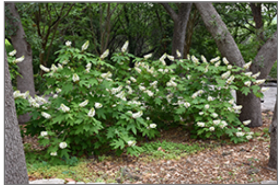
Oakleaf Hydrangea in bloom