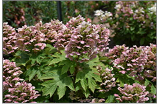
Oakleaf Hydrangea flowers (faded)