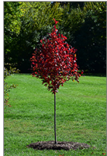
Green Gable Black Gum in fall