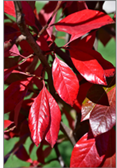
Green Gable Black Gum in fall

* This is a 'special order' plant - contact store for details