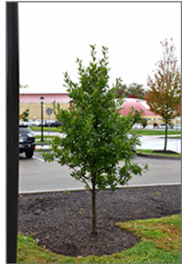
Green Gable Black Gum