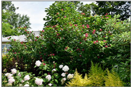
Aphrodite Sweetshrub in bloom