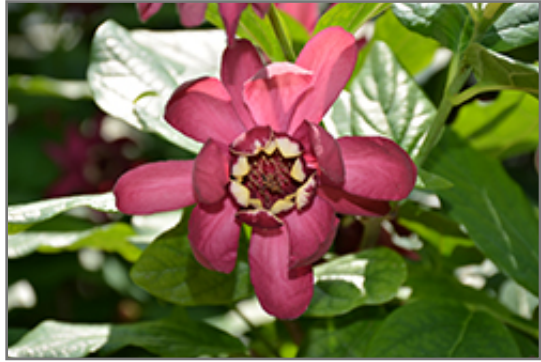
Aphrodite Sweetshrub flowers