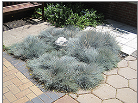
Blue Fescue