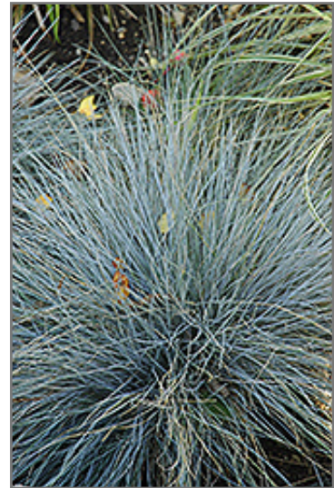
Blue Fescue

Blue Fescue is recommended for the following landscape applications;