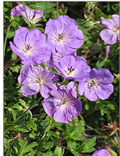
Rozanne Cranesbill flowers