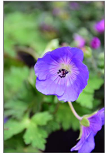
Rozanne Cranesbill flowers

This is a relatively low maintenance plant, and should only be pruned after flowering to avoid removing any of the current season's flowers. It is a good choice for attracting butterflies to your yard, but is not particularly attractive to deer who tend to leave it alone in favor of tastier treats. It has no significant negative characteristics.