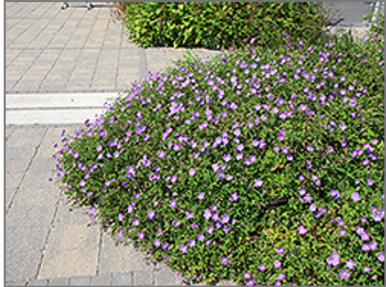
Rozanne Cranesbill in bloom

Rozanne Cranesbill will grow to be about 18 inches tall at maturity, with a spread of 24 inches. When grown in masses or used as a bedding plant, individual plants should be spaced approximately 20 inches apart. Its foliage tends to remain dense right to the ground, not requiring facer plants in front. It grows at a medium rate, and under ideal conditions can be expected to live for approximately 10 years. As an herbaceous perennial, this plant will usually die back to the crown each winter, and will regrow from the base each spring. Be careful not to disturb the crown in late winter when it may not be readily seen!