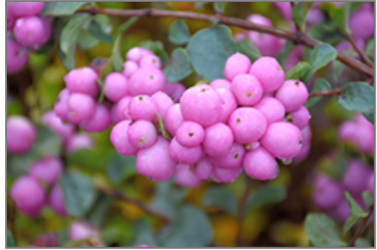
Proud Berry Coralberry fruit