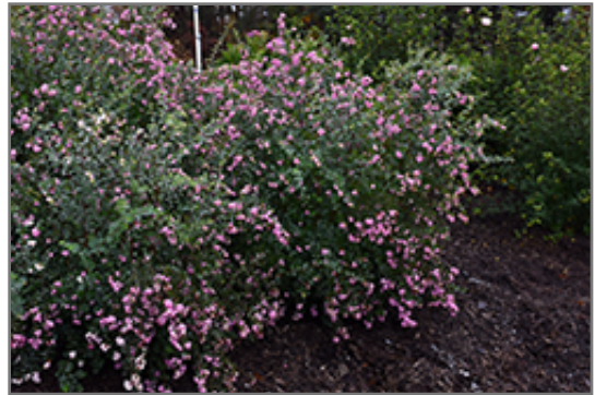
Proud Berry Coralberry fruit