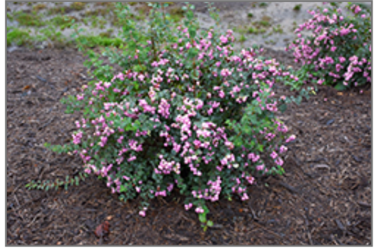
Proud Berry Coralberry fruit

This shrub performs well in both full sun and full shade. It is very adaptable to both dry and moist locations, and should do just fine under average home landscape conditions. It is not particular as to soil type or pH. It is somewhat tolerant of urban pollution. This particular variety is an interspecific hybrid.