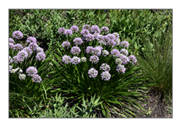
Peek-A-Boo Ornamental Onion in bloom