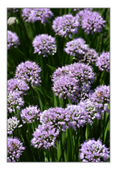
Peek-A-Boo Ornamental Onion flowers

Peek-A-Boo Ornamental Onion is an open herbaceous perennial with tall flower stalks held atop a low mound of foliage. Its relatively coarse texture can be used to stand it apart from other garden plants with finer foliage.