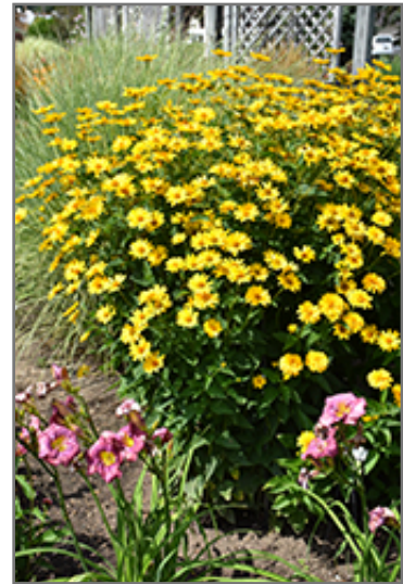
Summer Sun False Sunflower in bloom