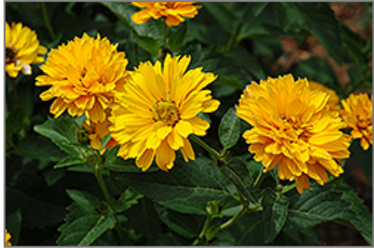
Summer Sun False Sunflower flowers

Summer Sun False Sunflower is recommended for the following landscape applications;