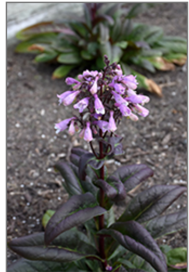
Blackbeard Beard Tongue in bloom