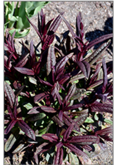
Blackbeard Beard Tongue foliage

* This is a 'special order' plant - contact store for details