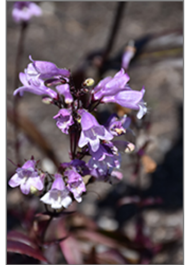
Blackbeard Beard Tongue flowers

Blackbeard Beard Tongue is recommended for the following landscape applications;