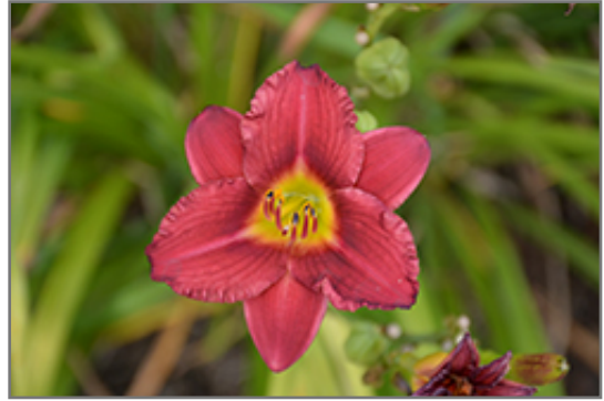
Pardon Me Daylily flowers

A reblooming variety with a compact, vigorous habit; fragrant, ruffled burgundy flowers with chartreuse-gold throats rise above mounds of arching green foliage; an elegant addition to borders, beds and containers; low maintenance and easy to grow