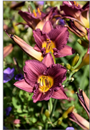
Purple de Oro Daylily flowers