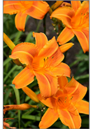
Rocket City Daylily flowers

An early-midseason bloomer, this selection features eye-catching orange flowers with coppery-bronze throats; tall, sturdy stems rise above low growing mounds of arching green foliage; an easy to grow selection, great for perennial borders, beds and containers