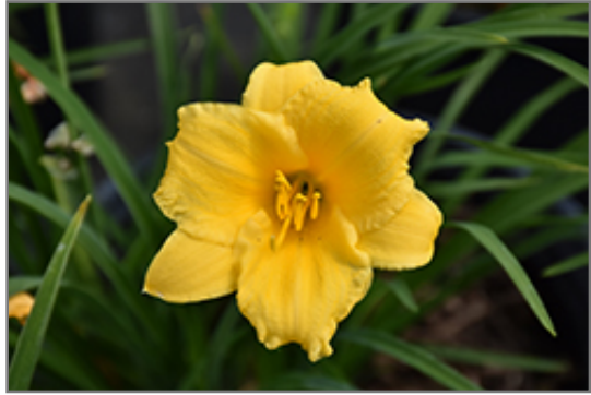
Stella de Oro Daylily flowers