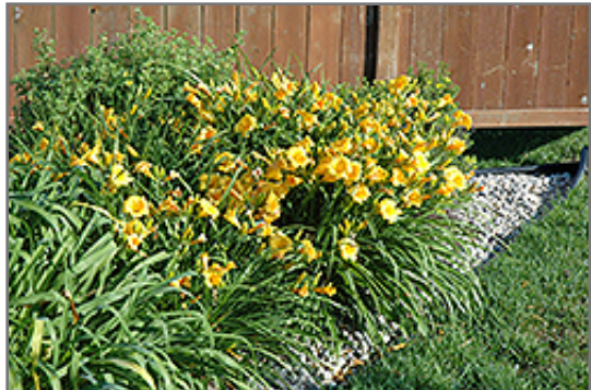
Stella de Oro Daylily in bloom