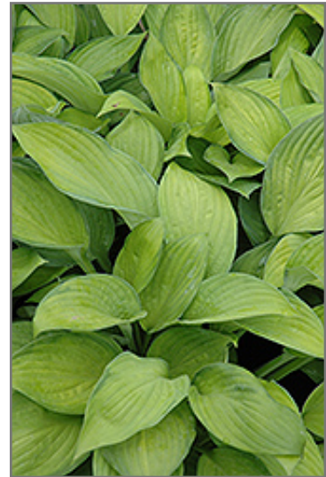
Gold Standard Hosta foliage

Gold Standard Hosta is recommended for the following landscape applications;