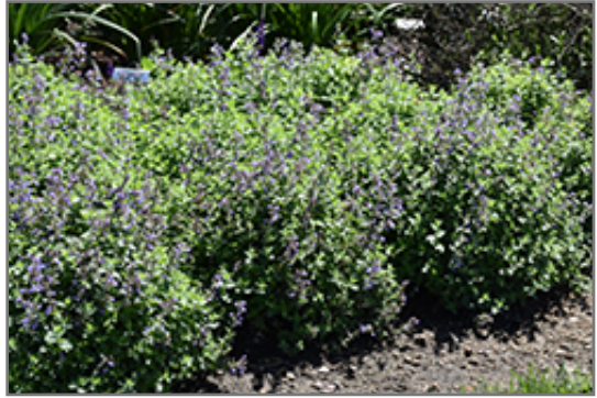
Cat's Pajamas Catmint in bloom

Cat's Pajamas Catmint will grow to be about 12 inches tall at maturity, with a spread of 20 inches. When grown in masses or used as a bedding plant, individual plants should be spaced approximately 18 inches apart. Its foliage tends to remain dense right to the ground, not requiring facer plants in front. It grows at a fast rate, and under ideal conditions can be expected to live for approximately 10 years. As an herbaceous perennial, this plant will usually die back to the crown each winter, and will regrow from the base each spring. Be careful not to disturb the crown in late winter when it may not be readily seen!