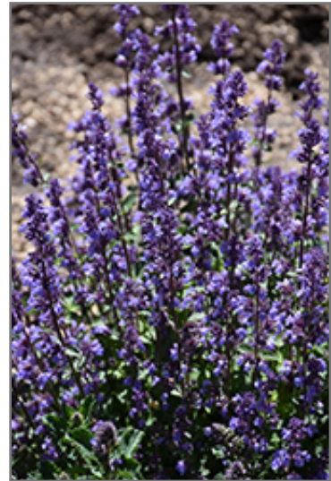
Cat's Pajamas Catmint flowers