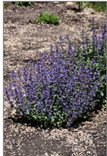
Cat's Pajamas Catmint in bloom