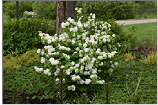
First Editions Opening Day Doublefile Viburnum in bloom

This shrub does best in full sun to partial shade. It does best in average to evenly moist conditions, but will not tolerate standing water. It is not particular as to soil type or pH. It is highly tolerant of urban pollution and will even thrive in inner city environments. This is a selected variety of a species not originally from North America.