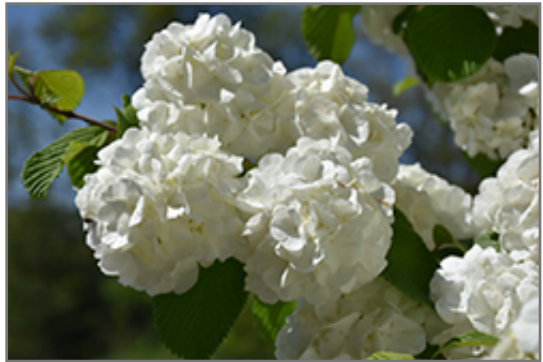
First Editions Opening Day Doublefile Viburnum flowers