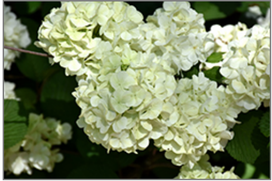
First Editions Opening Day Doublefile Viburnum flowers

First Editions Opening Day Doublefile Viburnum is recommended for the following landscape applications;