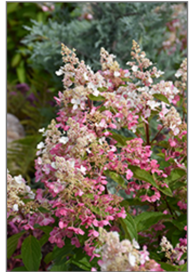
Pinky Winky Hydrangea (tree form) flowers

Pinky Winky Hydrangea (tree form) will grow to be about 8 feet tall at maturity, with a spread of 8 feet. It tends to be a little leggy, with a typical clearance of 4 feet from the ground, and is suitable for planting under power lines. It grows at a medium rate, and under ideal conditions can be expected to live for 40 years or more.