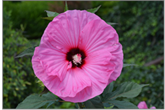
Summerific Candy Crush Hibiscus flowers

This plant will require occasional maintenance and upkeep, and should be cut back in late fall in preparation for winter. It is a good choice for attracting butterflies and hummingbirds to your yard. Gardeners should be aware of the following characteristic(s) that may warrant special consideration;