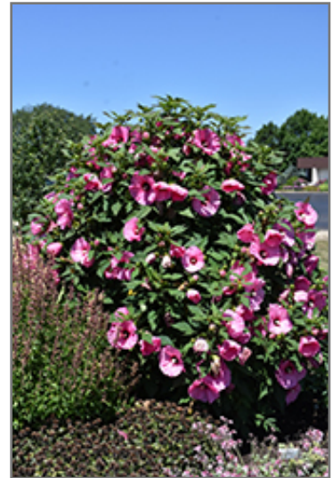
Summerific Candy Crush Hibiscus in bloom