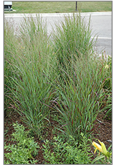
Shenandoah Reed Switch Grass