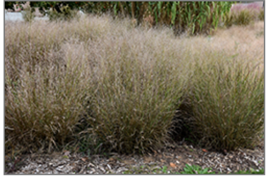
Shenandoah Reed Switch Grass fruit