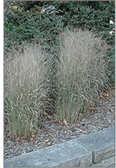
Shenandoah Reed Switch Grass in fall

* This is a 'special order' plant - contact store for details