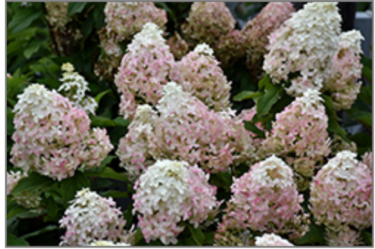
Quick Fire Fab Hydrangea flowers