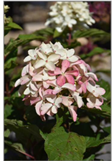
Quick Fire Fab Hydrangea flowers