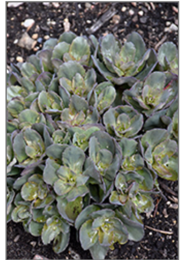
Rock 'N Grow Back in Black Stonecrop foliage