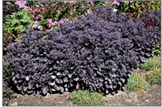
Rock 'N Grow Back in Black Stonecrop in bloom

Rock 'N Grow Back in Black Stonecrop is a dense herbaceous perennial with an upright spreading habit of growth. Its relatively coarse texture can be used to stand it apart from other garden plants with finer foliage.