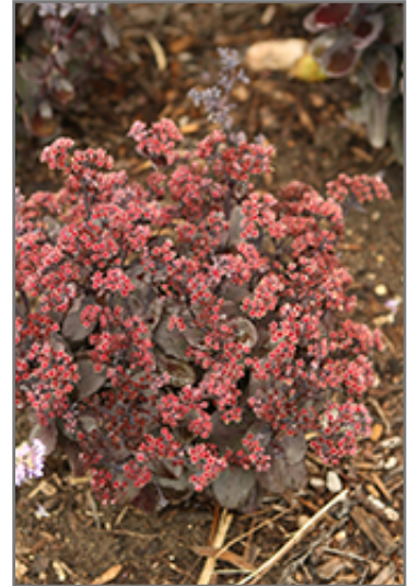
Rock 'N Grow Back in Black Stonecrop flowers

* This is a 'special order' plant - contact store for details