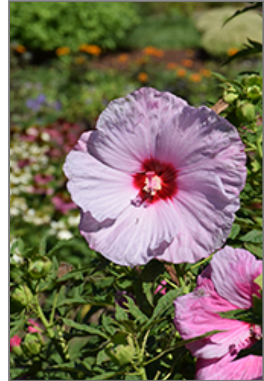
Summerific Lilac Crush Hibiscus flowers