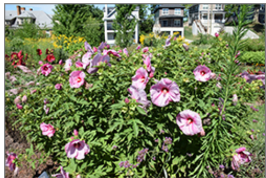
Summerific Lilac Crush Hibiscus in bloom