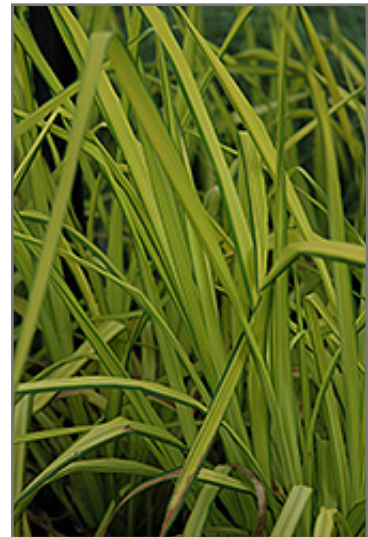
Bowles' Golden Sedge foliage