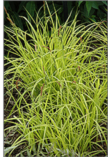
Bowles' Golden Sedge

Bowles' Golden Sedge is recommended for the following landscape applications;