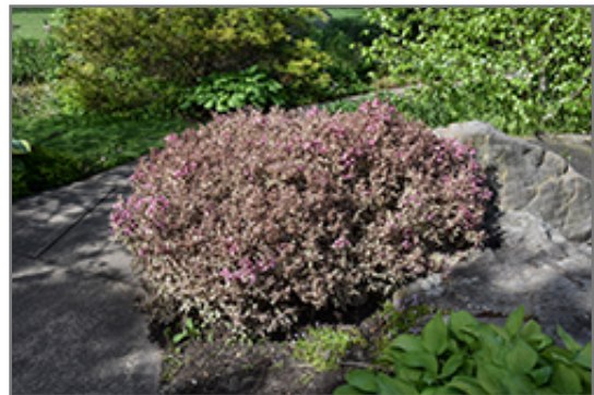
My Monet Purple Effect Weigela in bloom