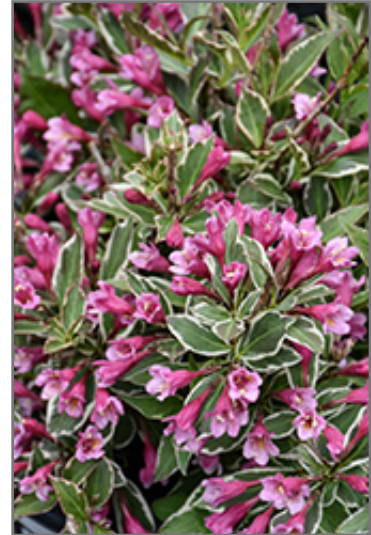
My Monet Purple Effect Weigela flowers

My Monet Purple Effect Weigela is recommended for the following landscape applications;