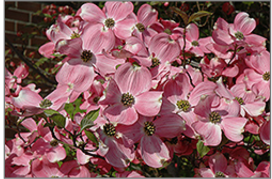
Cherokee Brave Flowering Dogwood flowers

This is a relatively low maintenance tree, and should only be pruned after flowering to avoid removing any of the current season's flowers. It is a good choice for attracting birds to your yard. Gardeners should be aware of the following characteristic(s) that may warrant special consideration;