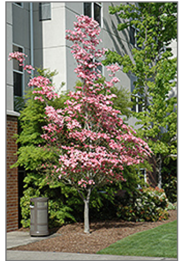
Cherokee Brave Flowering Dogwood in bloom