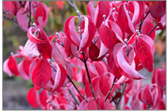
Cherokee Brave Flowering Dogwood in fall

Cherokee Brave Flowering Dogwood will grow to be about 30 feet tall at maturity, with a spread of 35 feet. It has a low canopy with a typical clearance of 4 feet from the ground, and should not be planted underneath power lines. It grows at a slow rate, and under ideal conditions can be expected to live for approximately 30 years.