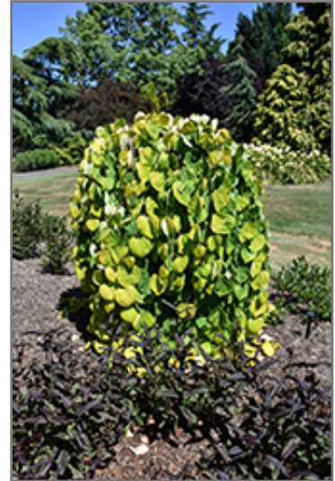
Golden Falls Redbud

A spectacular and hardy spring bloomer, with very showy pink flowers held tightly on bare branches in early spring; orange tinged, yellow emerging foliage matures to gold and lime green; a great weeping ornamental tree for specimen use in the landscape