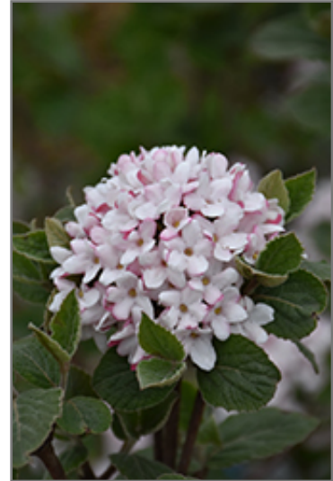
Sugar n' Spice Koreanspice Viburnum flowers