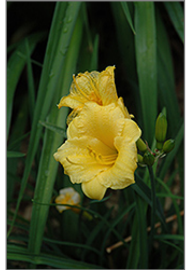
Mini Stella Daylily flowers