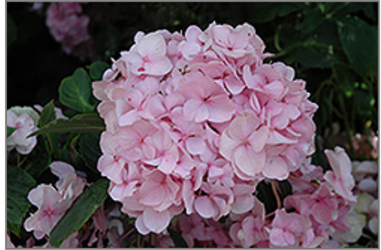
All Summer Beauty Hydrangea flowers

All Summer Beauty Hydrangea will grow to be about 3 feet tall at maturity, with a spread of 4 feet. It tends to be a little leggy, with a typical clearance of 1 foot from the ground. It grows at a fast rate, and under ideal conditions can be expected to live for approximately 20 years.