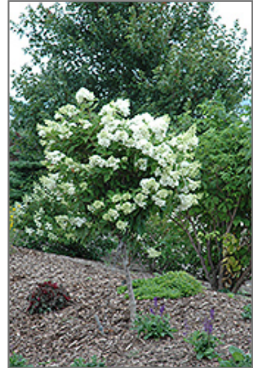
Pink Diamond Hydrangea (tree form) in bloom

Pink Diamond Hydrangea (tree form) will grow to be about 8 feet tall at maturity, with a spread of 6 feet. It tends to be a little leggy, with a typical clearance of 3 feet from the ground, and is suitable for planting under power lines. It grows at a medium rate, and under ideal conditions can be expected to live for 40 years or more.