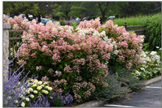
Quick Fire Hydrangea in bloom