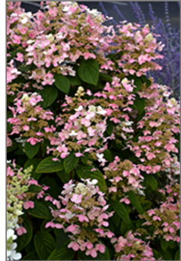
Quick Fire Hydrangea flowers